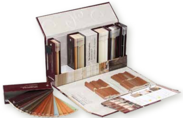
Venetian binder P/N VENETIAN-BINDER