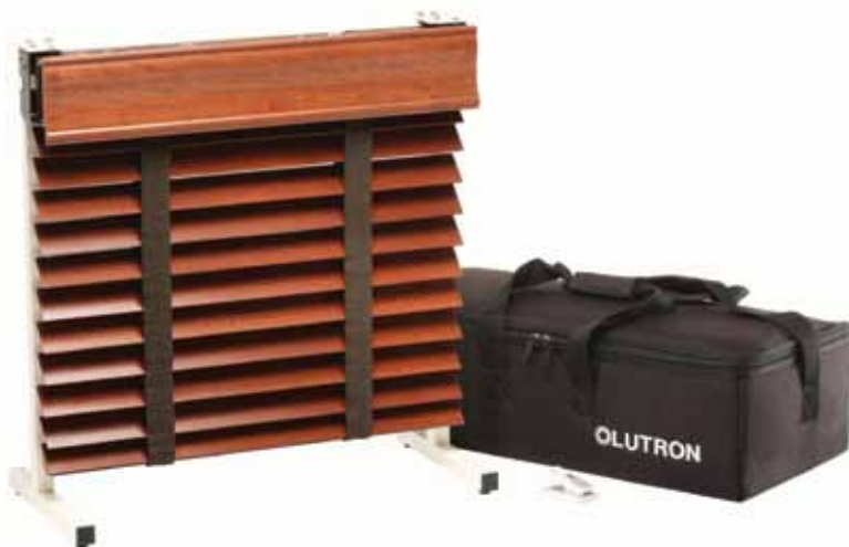
Venetian Demo P/N VENETIAN-DEMO-WD (shown) P/N VENETIAN-DEMO-AL (aluminum demo also available)

All marketing materials can be ordered using the shade configuration tool (SCT). PDFs are also available online at www.lutron.com under Service and Support.